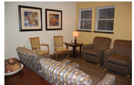
Tenants at the Roselyn now enjoy the newly renovated community room (top) and studio apartments.

The first big gathering was held on February 10 th . NHA threw a party to thank the residents for their patience throughout a period of upheaval, the funders, and all the people responsible for the gorgeous rehab. And the many, many heroes who saved lives and reminded each of us that we can accomplish great things when we work together for our neighbors!